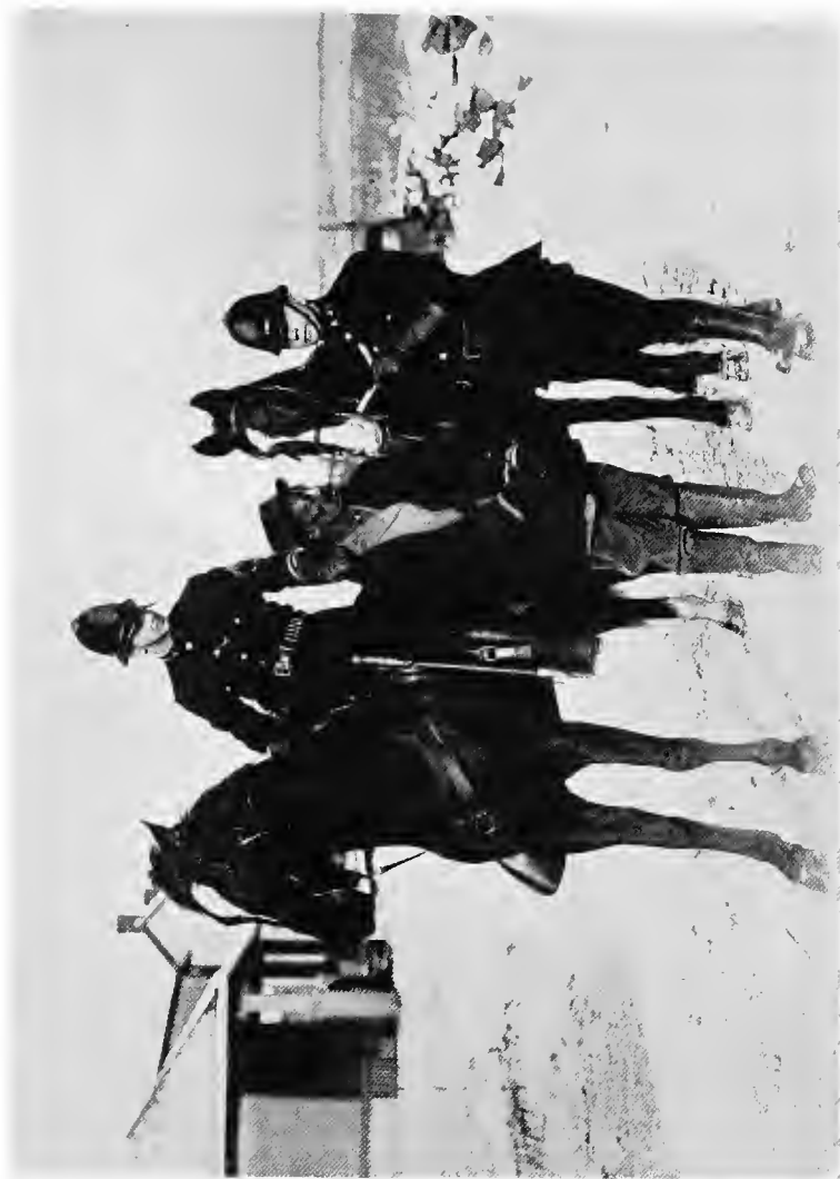
A SHARP EMBARRASSMENT